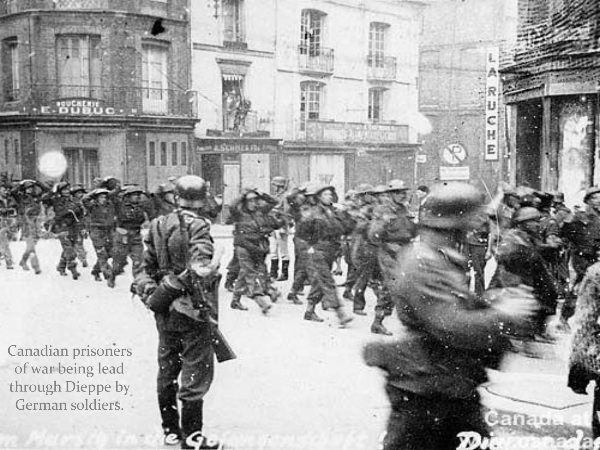
Canadian prisoners of war being lead through Dieppe by German soldiers.