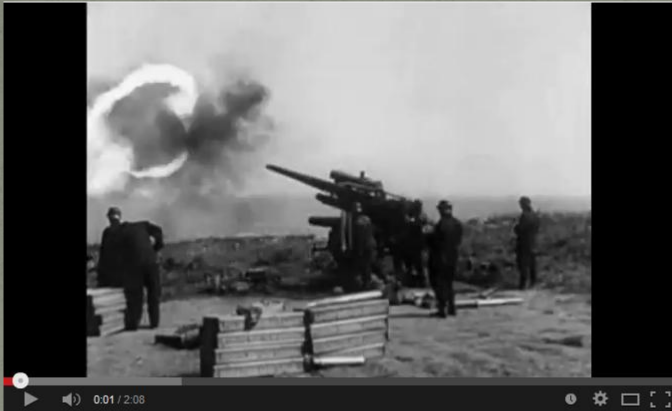
Assault footage of Dieppe Raid.