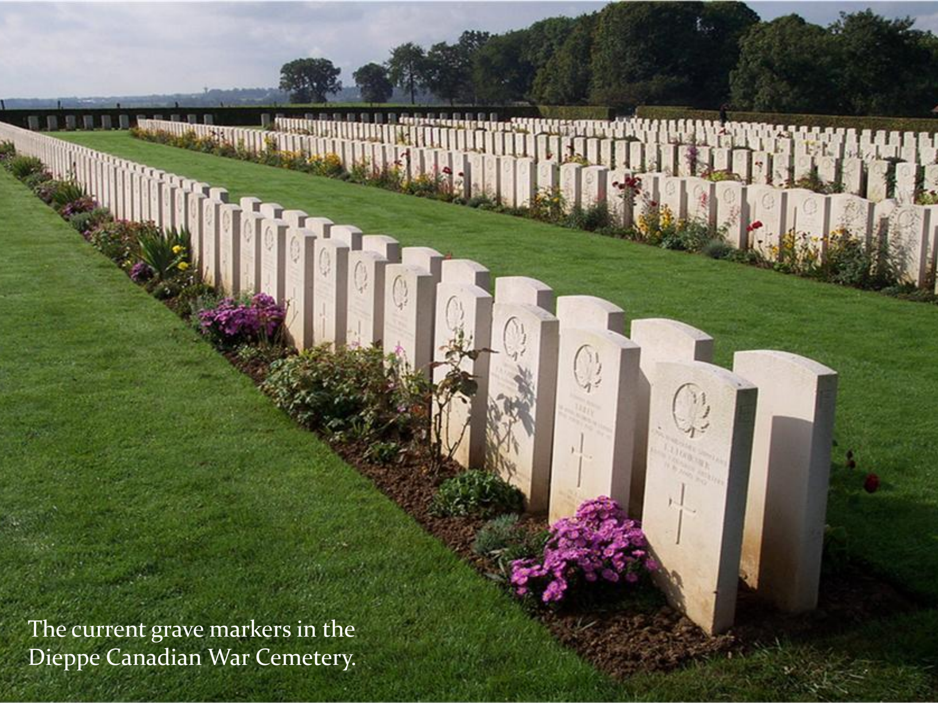
The current grave markers in the Dieppe Canadian War Cemetery.