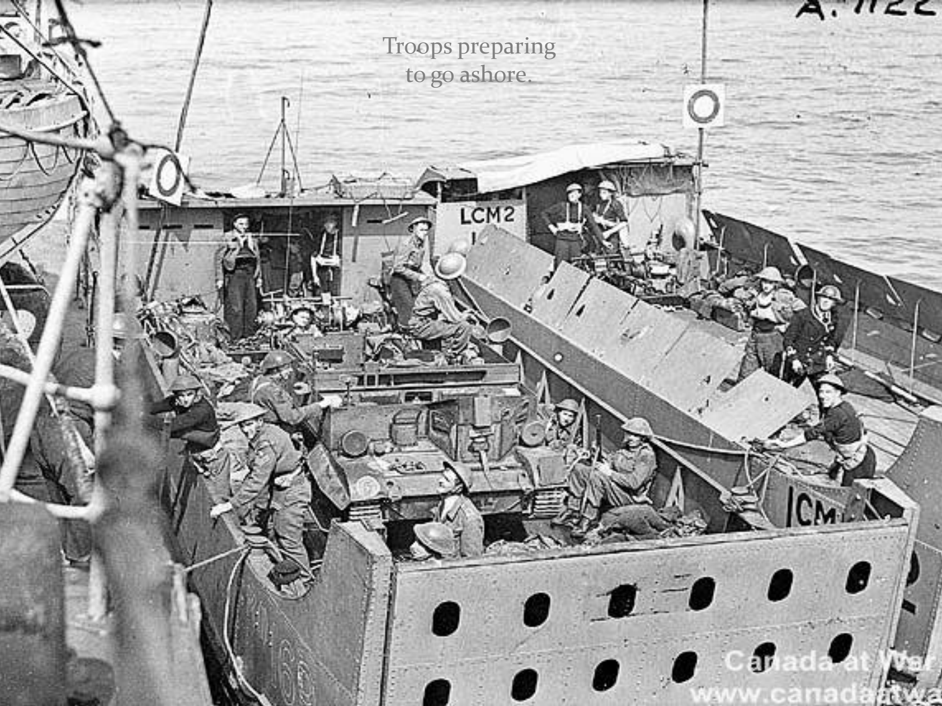
Troops preparing to go ashore.