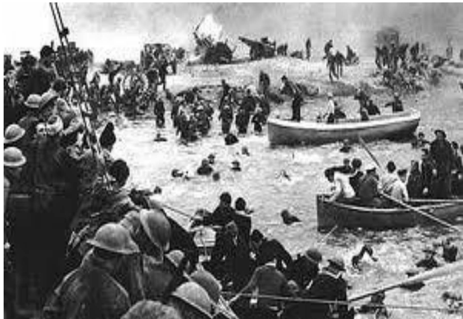
British troops under fire on the beach at Dunkirk, France.