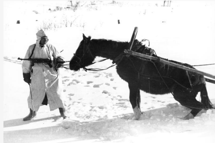
Winter 1941, USSR