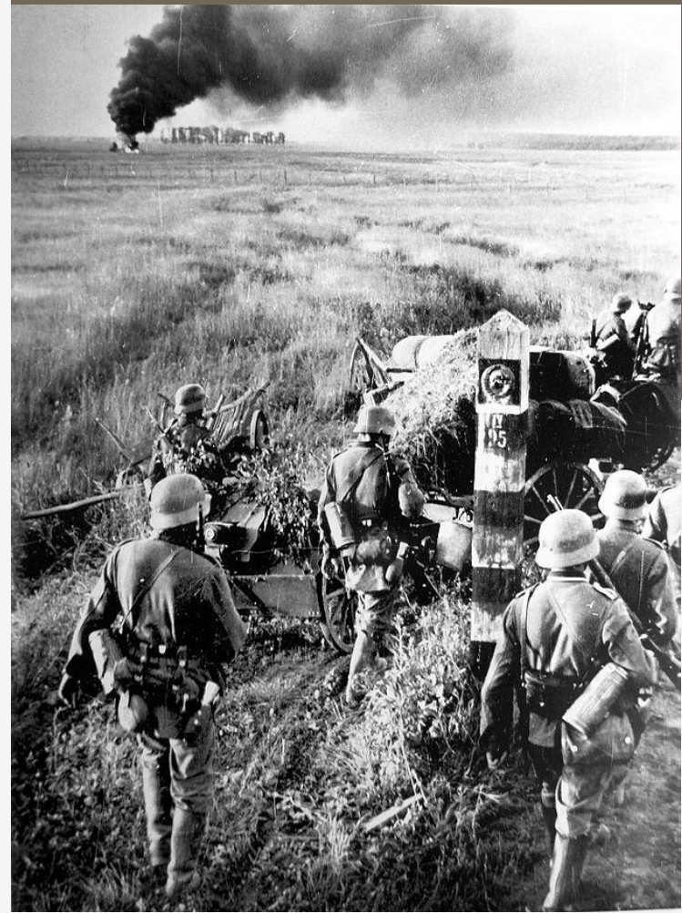
German troops crossing USSR border