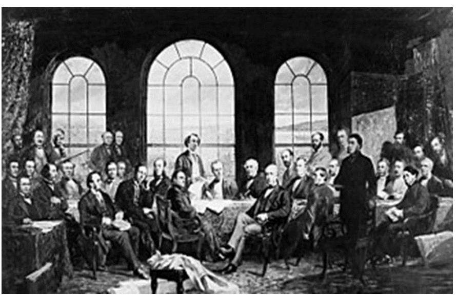
Conference meeting at Quebec 1884.

Many say confederation will help increase our protection. Irish immigrants called "fenians" are constantly attacking the borders of our colonies from the United States. Canada East, Canada West, and New Brunswick are all fearful of an invasion. With confederation, all our military can work together to protect our borders.