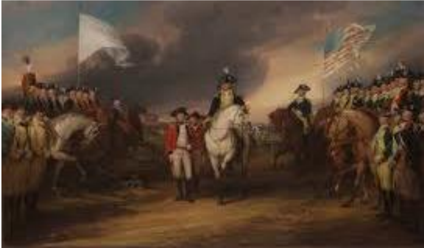
Surrender of general Cornwallis at Yorktown | 1781